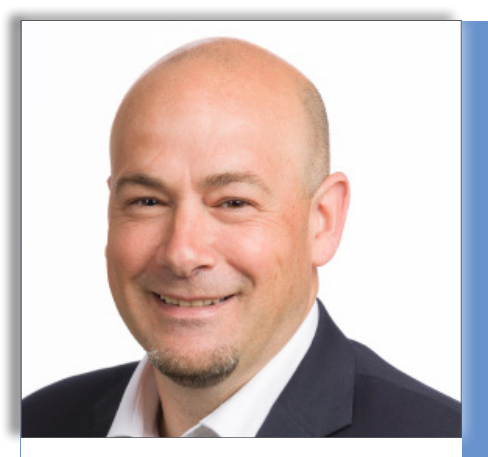
C5 Exec Chair: Term expires end 2022